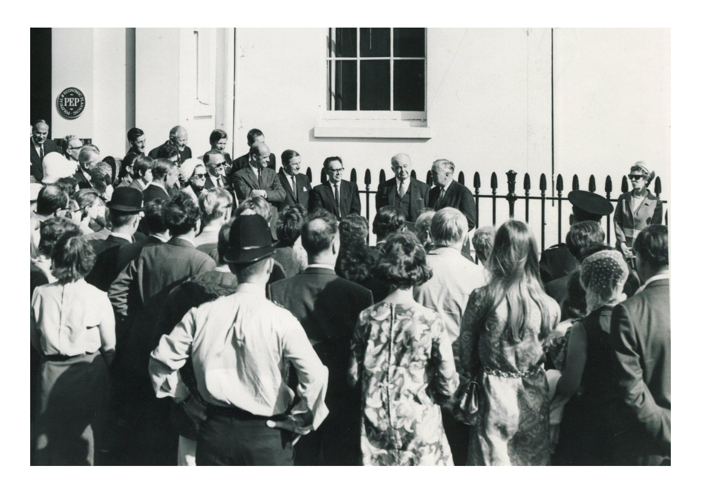
Unveiling the commemorative plaque at Policy and Economic Planning (1967)<sup>3</sup>